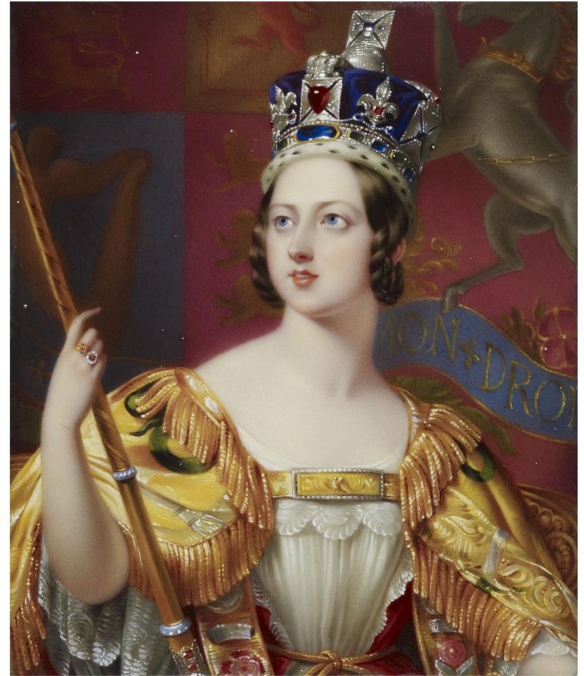
Queen Victoria - Coronation portrait by George Hayter - 1838

“I say that the Church of England is wonderfully and mysteriously fitted for the souls of a free Norse-Saxon race, for men whose ancestors fought by the side of Odin, over whom a descendant of Odin now rules.”