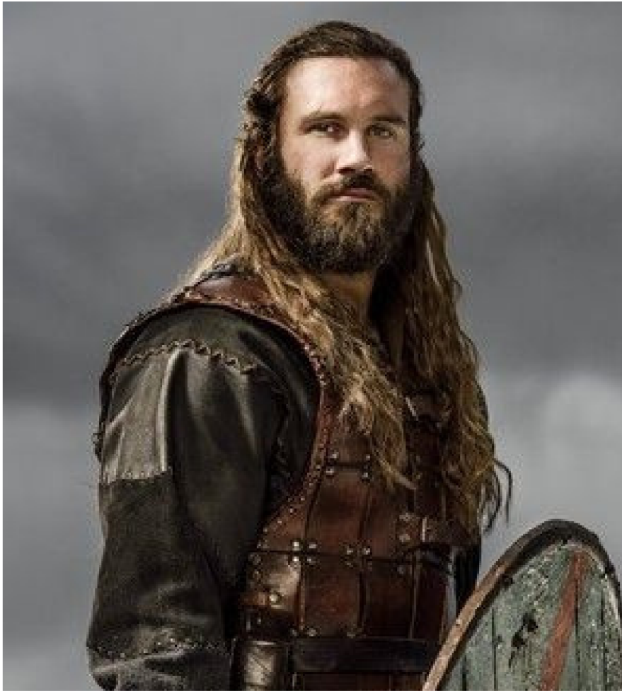
Photo of Vikings Rollo - Season 3 - Official Picture for fans of Vikings (TV Series) 38231954