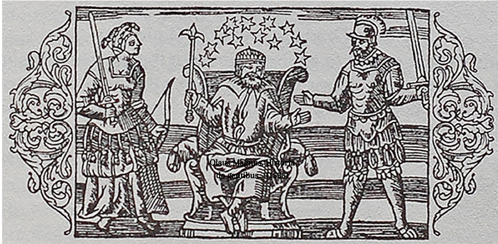
'On the three Main Gods of the Geats.' Left to right: Frigg, Þórr and Óðinn.

Magnus, Olaus . Historia de Gentibus Septentrionalibus . (1555 151)