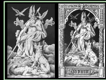
Old Norse Stories (1908)