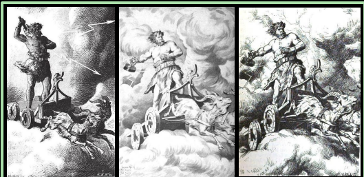
Deutsche Götter- und Heldensagen (1897)