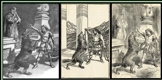
Second Language Reader (1908)

Using the digital archives MyNDIR and germanicmythology.com